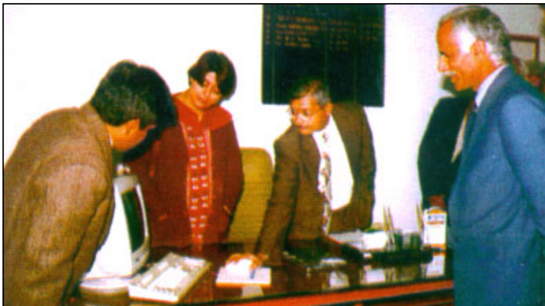
The web site of Distt Rewari being inaugurated