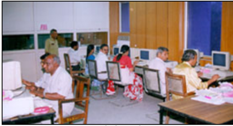
A busy day in NIC Sub Centre at Indore