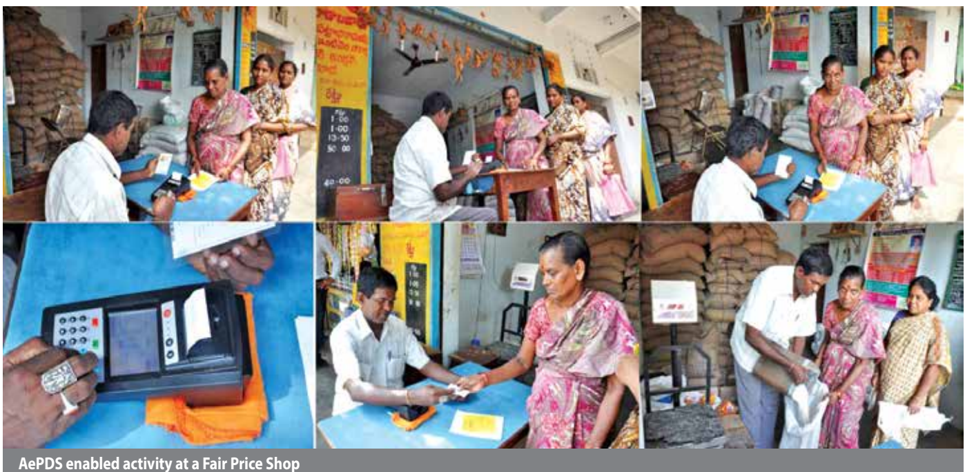
AePDS enabled activity at a Fair Price Shop