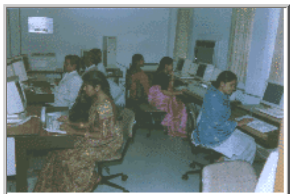
The Orissa Legislative Assembly Computer Centre

computerization of the State Assembly is on the cards. Training has already been imparted to operational staff.